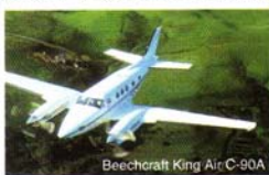
Beechcraft King Air C-90A

With the latest 8 Seater King Air C-90A added to our fleet, we offer Air Conditioned, Pressurized Club Seating, with more luxury than a